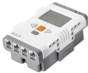
Fig. 3. The Processor Used in Robots.